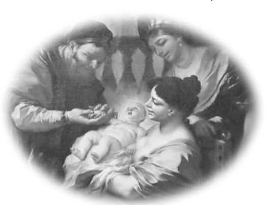
The Most Holy Trinity June 7, 2020